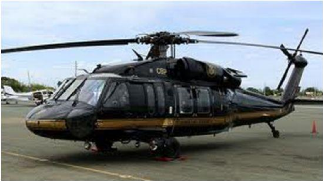
U.S. Customs UH-60 Black Hawk helicopter.

U.S. Customs deploys over 1,354 Radiation Portal Monitors at Ports of Entry to prevent terrorists from attempting to smuggle radiological materials used in nuclear and radiological dispersal devices.